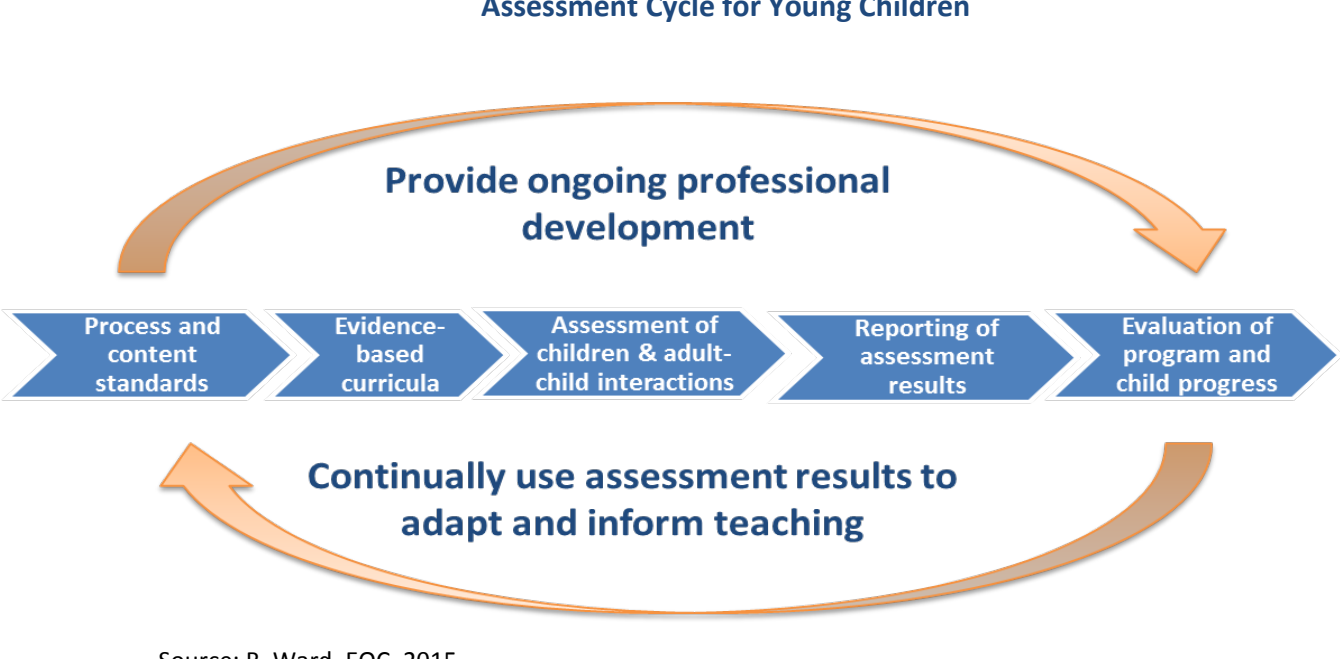
Figure 1 Assessment Cycle for Young Children